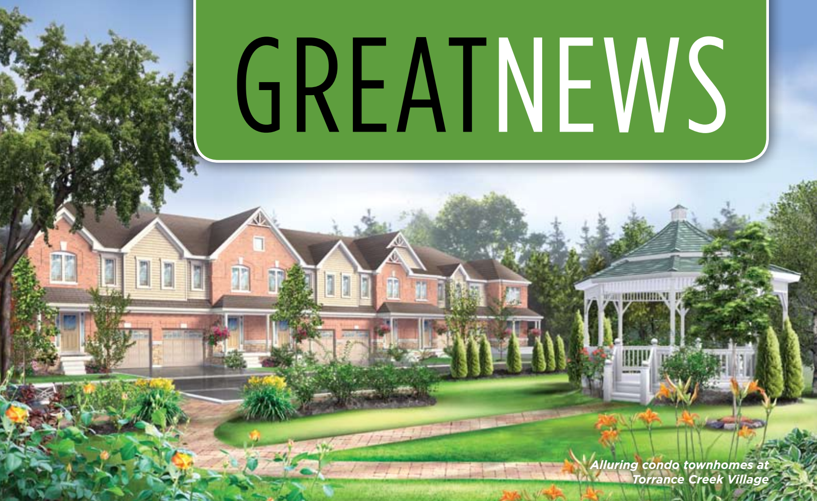
Alluring condo townhomes at Torrance Creek Village