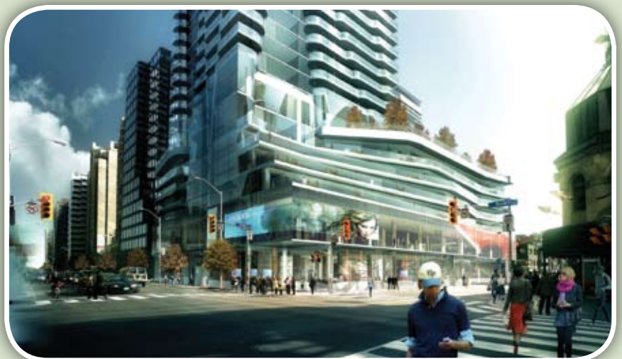
Yonge and Bloor tomorrow. Your opportunity today.

To book your appointment, call 416-922-0081 or visit onebloor.com .