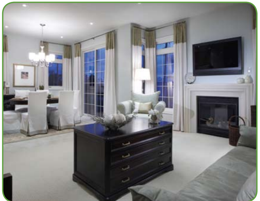
The Montrose bungalow model offers spacious living

Benefit from prices up to $200,000 less than in the GTA at Great Gulf's Edgewood, in Niagara Falls. Situated in the midst of Ontario's wine country, this highly successful community is already home to hundreds of families. Live across the street from the Ontario Golf Association-rated Niagara Falls Golf Club, close to 40 other championship courses, existing public and separate schools, discount designer shopping, and more. The U.S. border and Buffalo International Airport are minutes away, and Edgewood is just 90 minutes from Toronto. Choose from two-storey detached homes and stunning bungalows on 50' lots. Be sure to tour Great Gulf's multi-award-winning furnished models - the 2,300 sq. ft. Elgin (Elevation C), 2,575 sq. ft. Logan (Elevation B), 1,740 sq. ft. Montrose (Elevation A) bungalow, and the 2,660 sq. ft. Chippawa (Elevation B) Corner Model Home/Sales Office at 9118 Forestview Blvd. off Garner. Call 905-356-9408.