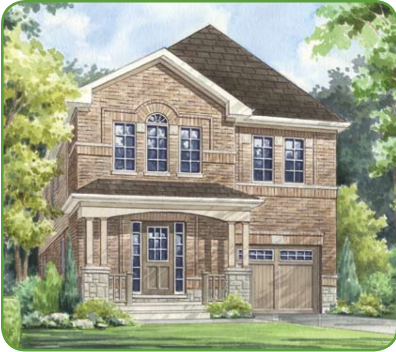
The 1,970 sq. ft. Hartman B 30' Single at Grandview

In the Taunton and Harmony Road area of north Oshawa, Great Gulf Homes offers fantastic new home value at two highly successful communities - Stonecrest and Grandview. Discover prices that are up to $200,000 lower than equivalent homes elsewhere in the Greater Toronto Area. Stonecrest encompasses a parkette and landscaped pond, plus residents live steps from a Sobeys Ready to Serve, local school and plaza. Grandview features a park and landscaped storm water management pond. Both of these successful communities are close to a wealth of existing amenities. Choices include semis, single-family designs on 30' lots, plus detached homes on 36', 40' and 50' lots. To see Great Gulf's design and construction quality for yourself, tour the three fully furnished model homes: the 3,245 sq. ft. Crystal (Elevation C), the 2,560 sq. ft. Fieldstone (Elevation B), and the 3,095 sq. ft. Amber (Elevation C). The Model Home/Sales Office is at 1359 Clearbrook Drive (north off Taunton, west of Harmony). Call 1-888-579-7235.