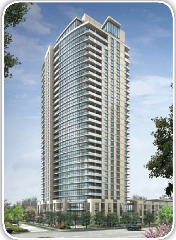
Get into the Final Phase of One Sherway

Parking is included in the incredible prices, so don’t wait. The One Sherway Presentation Centre is located at 700 Evans Avenue, across from Sherway Gardens. Call 416-695-3535 or visit onesherway.com .